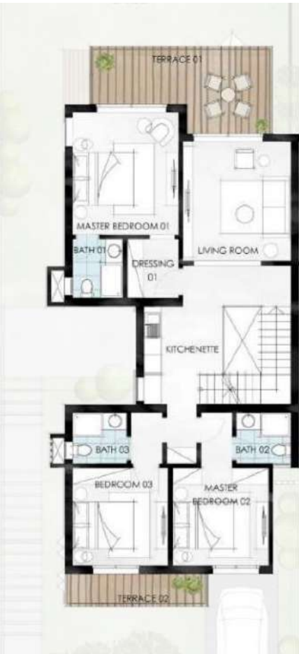
TW02 - First Floor | Left