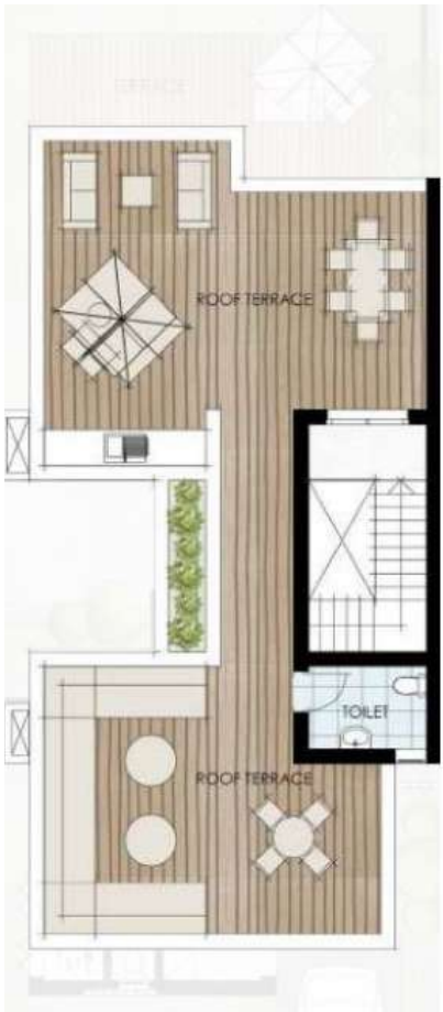
TW02 - Roof Floor | Left