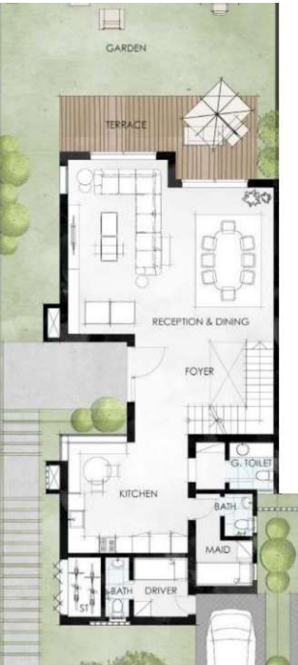
TW02 - Ground Floor | Left